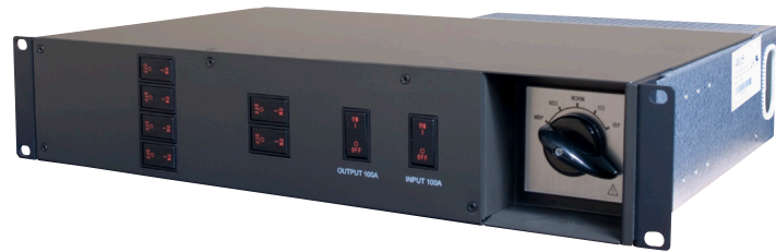
NEMA panel being shown